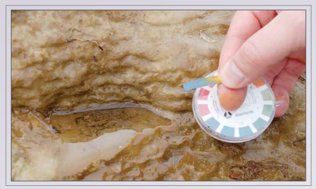
Pictured above is a high pH (alkaline) serpentinite spring in Newfoundland, Canada. Water-rock reactions generate energy to support microbial growth, but can create challenging conditions that test the limits of habitability.

Aeronautics and Space Administration (NASA) to study how rocks can provide energy for life and how that may impact the origins, evolution, distribution and future of life in the universe.